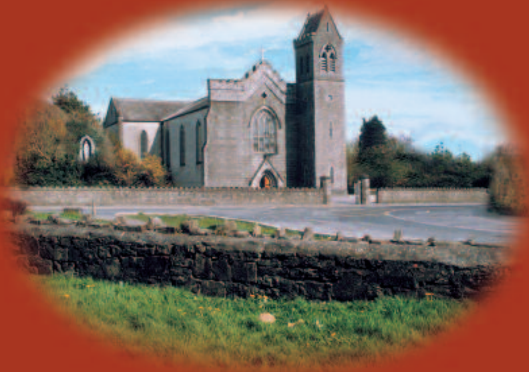
St Mary's & Ladychapel Parish, Maynooth